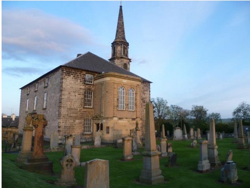
St. Michael's Parish Church, Inveresk, Scotland

Inveresk Parish Churchyard, Scotland contains 72 War Graves from both World Wars. 36 War Graves are from World War 1 & 36 War Graves are from World War 2. There are 2 Australian War Graves in this Churchyard, one from each of the World Wars.